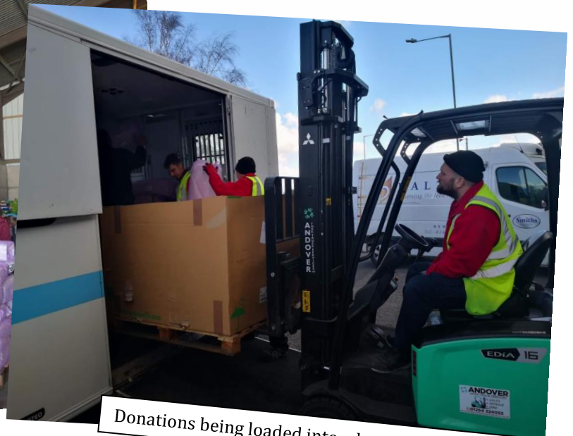
Donations being loaded into a lorry going to Ukraine.