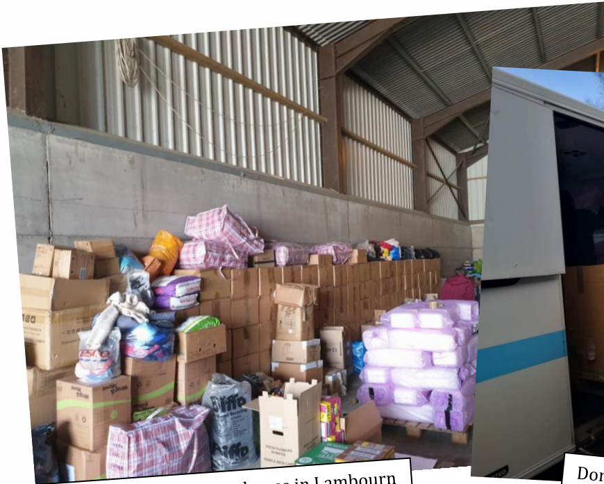
Your donations in the warehouse in Lambourn

Here are some photos of your items on their way to Ukraine: